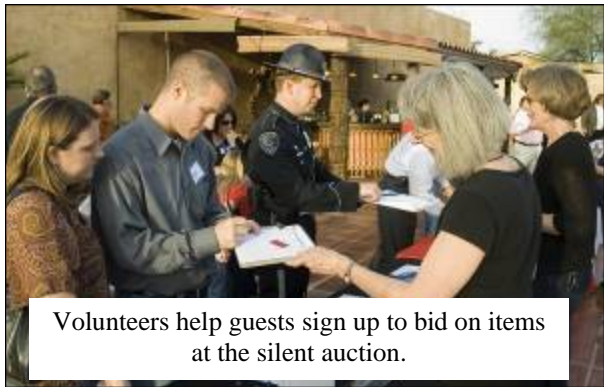
Volunteers help guests sign up to bid on items at the silent auction.