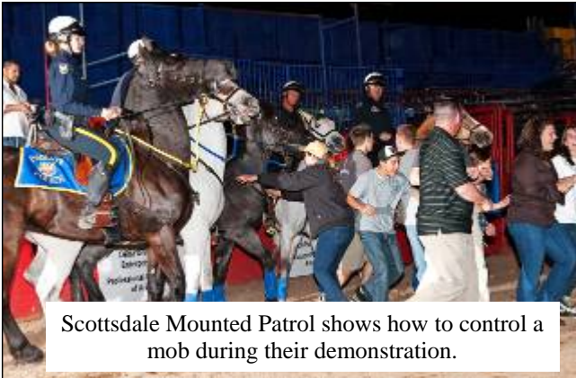
Scottsdale Mounted Patrol shows how to control a mob during their demonstration.