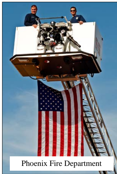
Phoenix Fire Department