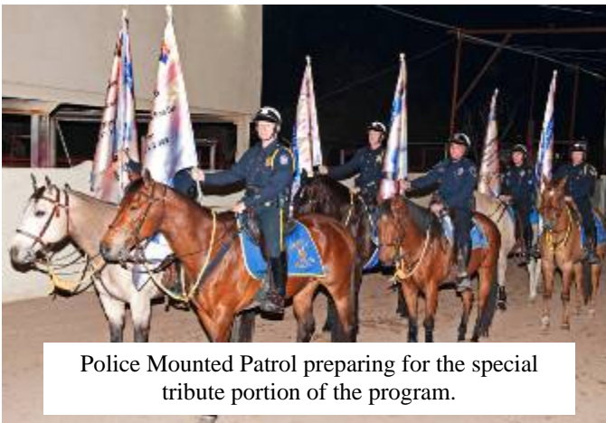
Police Mounted Patrol preparing for the special tribute portion of the program.

See highlights and other photos from this 100 Club annual event on page 7.